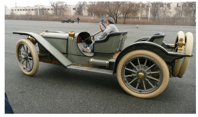
1909 American Underslung