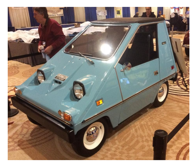
1976 Vanguard CitiCar (EV)