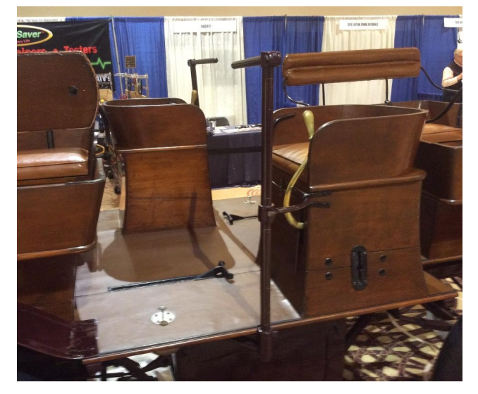
Note the Dual Driver Seats

As seen on page 40 of the March/April 2020 "Antique Automobile", this is one of two "coaches" built specifically for moving up to 12 passengers through the tunnel between the Senate Office Building and the U.S. Capital. The tunnel was too narrow for the coaches to turn around, so there was a driver's seat for each direction so that the driver could see where he was going without having to look over his shoulder.