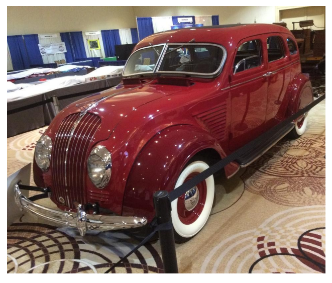
1934 DeSoto SE Airflow Four Door Sedan