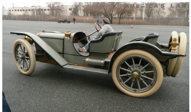
1909 American Underslung