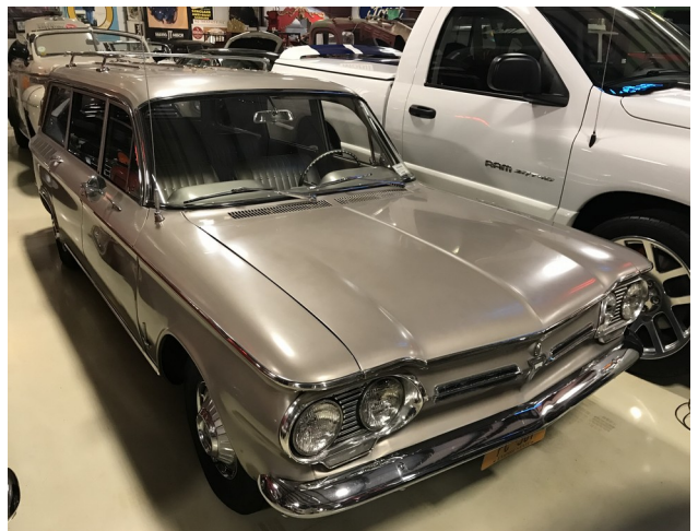
And to warm your editor's heart, there was even a Corvair – a '63 Lakewood wagon