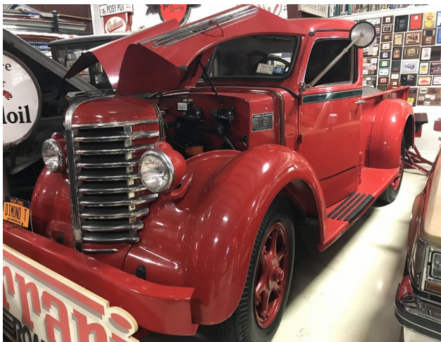
A post-WWII Diamond T 1-ton pickup