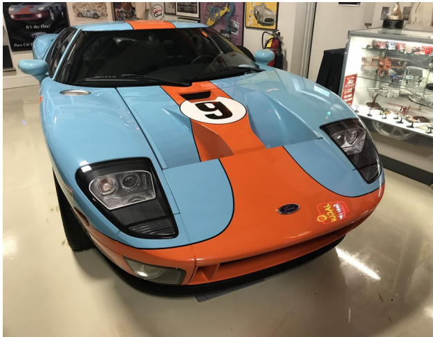
4 miles on the odo of this original '06 Ford GT