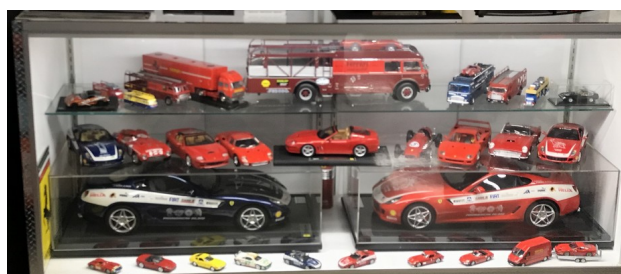
Scores of diecast models