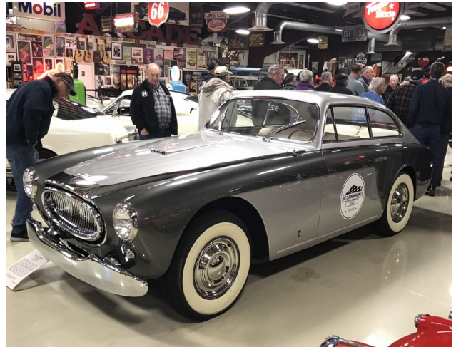
A stunning '53 Cunningham C-3