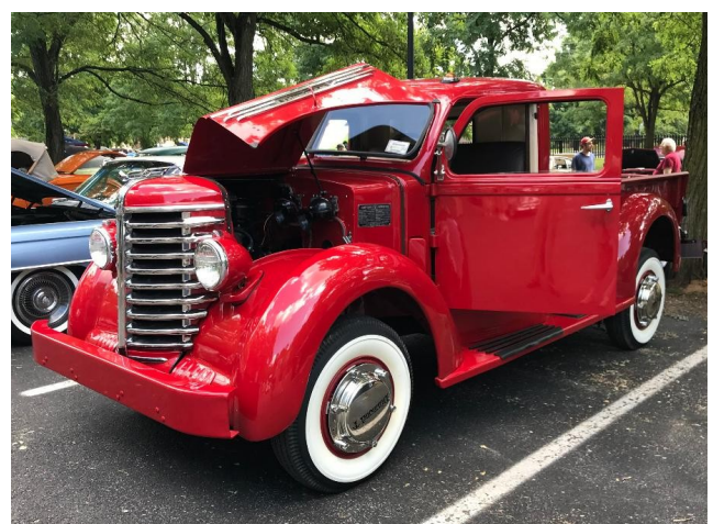
Late 40's Diamond T