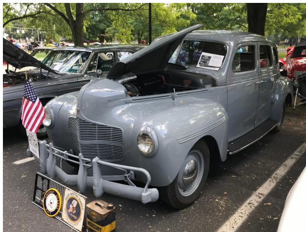
WWII – era Dodge “Blackout” Staff Car