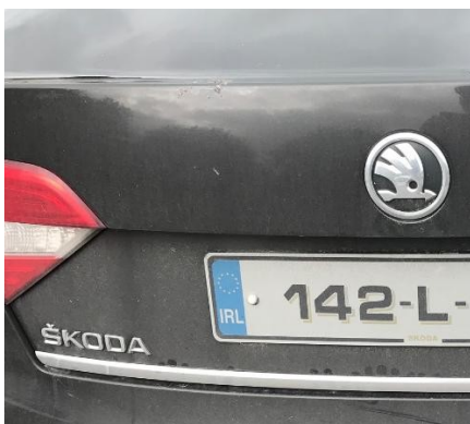
Skoda – Czechoslovakian VW