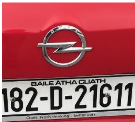
Opel – German Groupe PSA