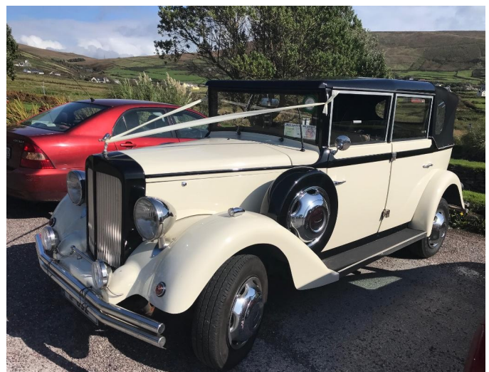
Regent Replica – England, on Dingle Peninsula

As you may know, your editor spent 23 days in September in Ireland. We had only five days of light rain. The scenery and the seafood were spectacular, the people were very friendly and the roads were – for the most part - narrow and very narrow. We covered about 1,400 miles, went to a flying boat museum, attended a chamber music festival, heard traditional Irish music at a number of pubs around the Emerald Isle and developed a taste for Irish coffee and Bailey's coffee – Guinness not so much.