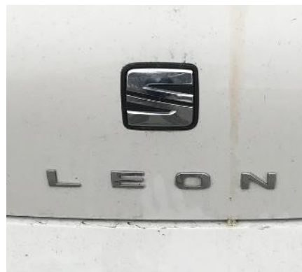
Seat – Spanish VW