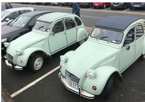
Two French couples on vacation brought their Citroen 2CVs to a parking lot by the bay in Dingle.