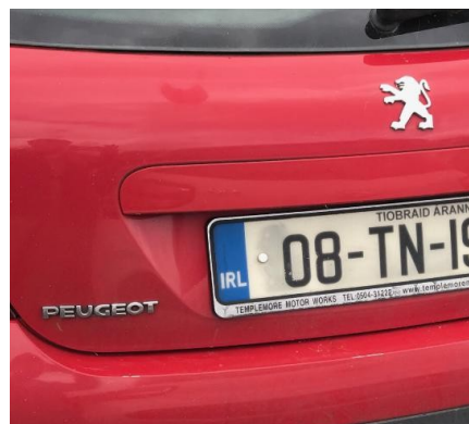
Peugeot – French Groupe PSA