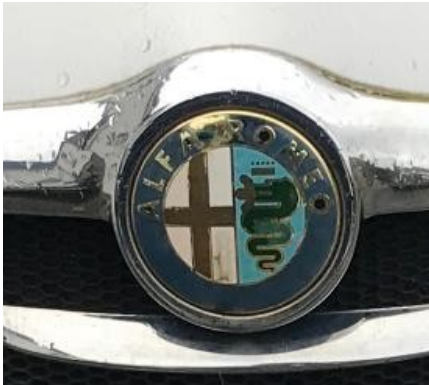
Alfa Romeo – Italy