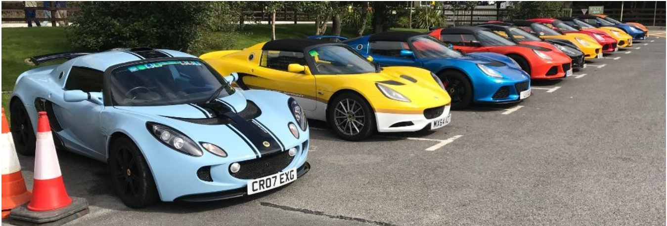
A group of Lotus enthusiasts on tour at the Kylemore Abbey, County Clare, Ireland