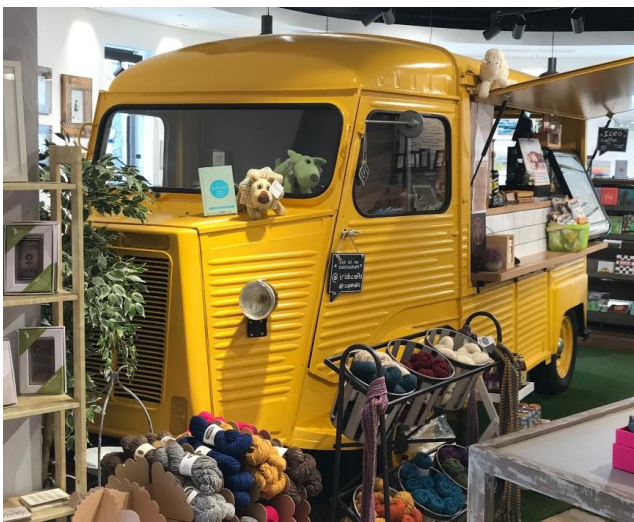
Citroen food truck in a gift shop, Doolin