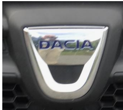
Dacia – Romanian Renault