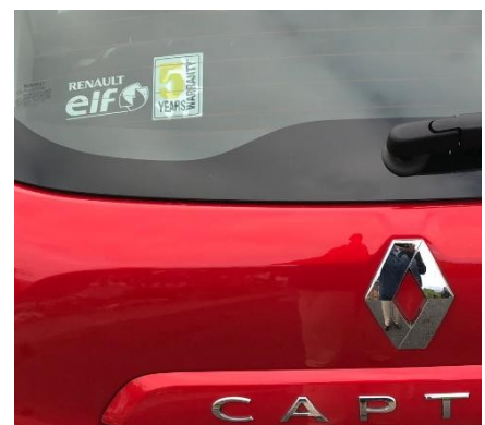
Renault – France