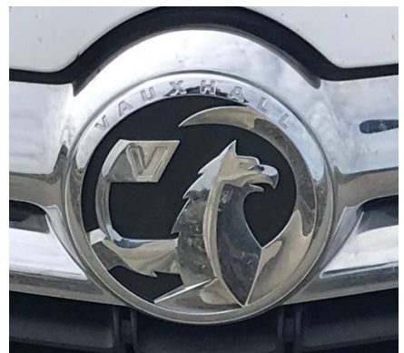
Vauxhall – English Groupe PSA

Turns out, as automakers consolidate, Groupe PSA is the parent company of Peugeot, DS, Citroen, Opel and Vauxhall. Groupe Renault manufactures Dacia in Romania, Samsung in South Korea, AutoVaz in Russia and is allied with Nissan and Mitsubishi in Japan.